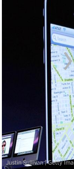
Launch date: June 9, 2008

Apple CEO Steve Jobs declared, "Today Apple is going to reinvent